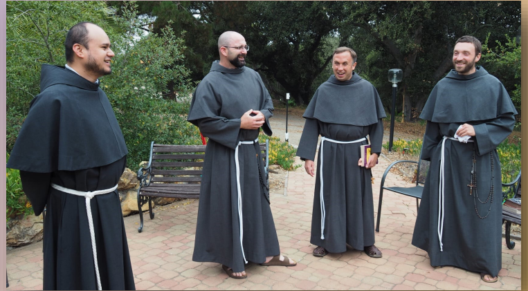
Above Left & Right: July 21, 2020