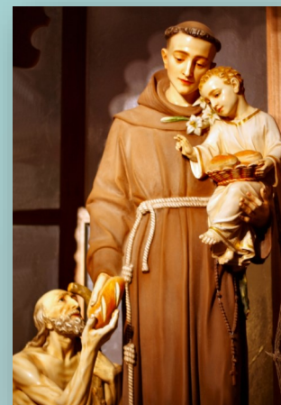
The Origin of St. Anthony's Bread, from St. Anthony's Messenger

One legend dates back to the year 1263, when a child drowned near the Paduan Basilica of St. Anthony during its construction. The child's mother prayed to the saint to bring her boy back to life. In return, she promised to give to the poor an amount of corn equal to the child's weight. When the child was miraculously revived, the mother made good on her promise.