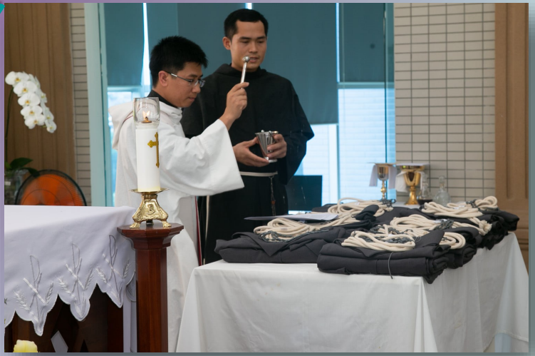
Above & Left: On Saturday, August 1, 2020, nine novices from the Provincial Delegation in Vietnam (of the Province of St. Joseph of Cupertino in the USA [SJC]) were vested in the habit. The ceremony took place at the St. Anthony of Padua Friary in Hồ Chí Minh City, Vietnam.