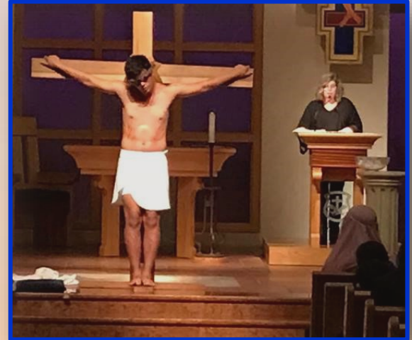
A Scene from a powerful Passion Play at Our Lady of Guadalupe Parish Hermosa Beach.