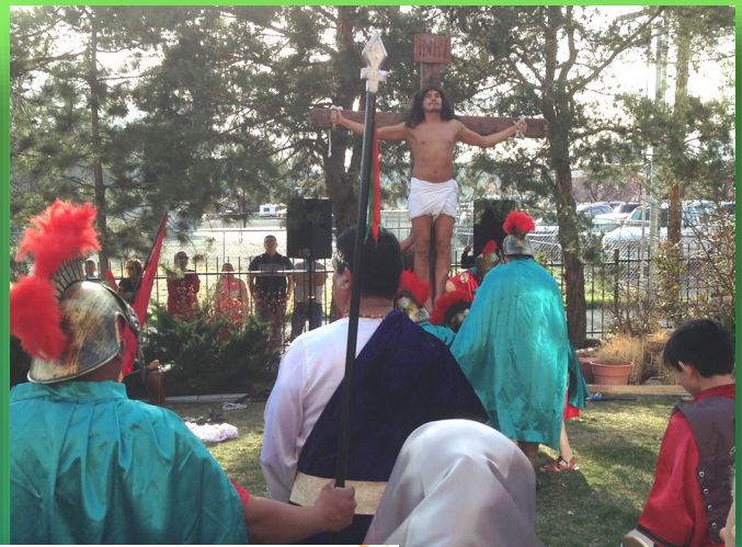
TOP RIGHT: Good Friday Reenactment at Saint Thomas Aquinas Cathedral in Reno, NV.