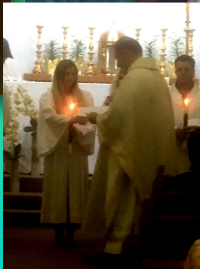
BOTTOM LEFT: Easter Day in Coalinga.