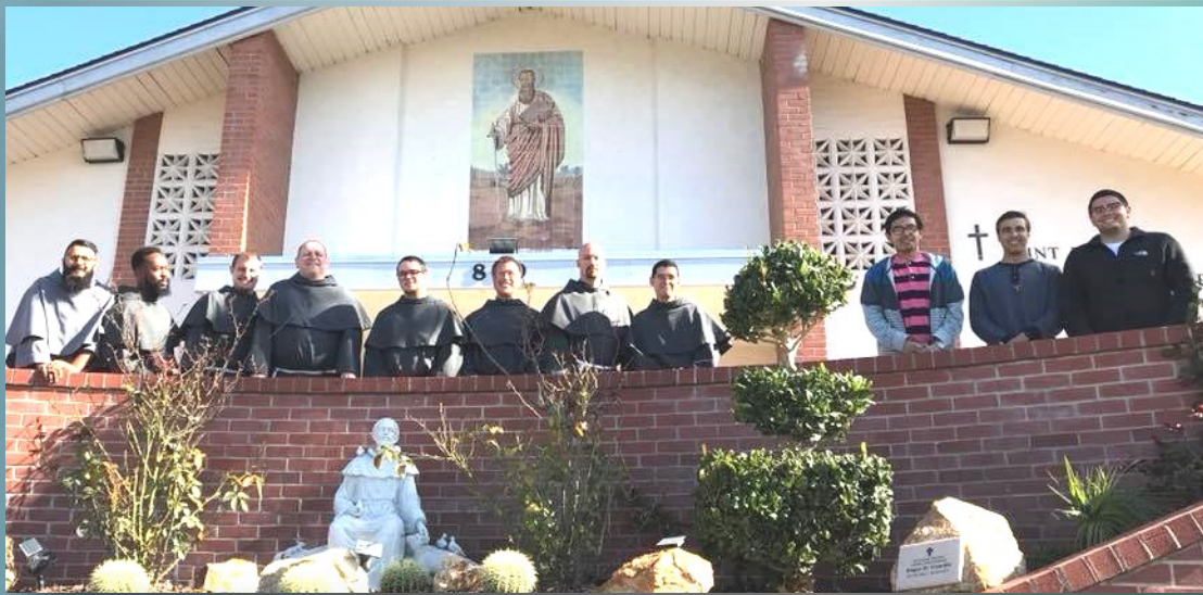
LEFT: Novices pose with attendees of the Province's most recent "Come and See" weekend back in February.